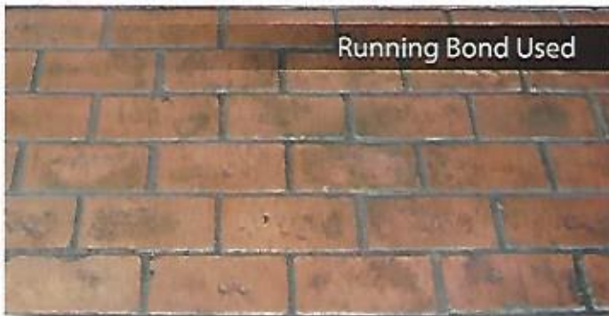
Running Bond Used

Color Hardener: Cream Buff | Release Color: Walnut