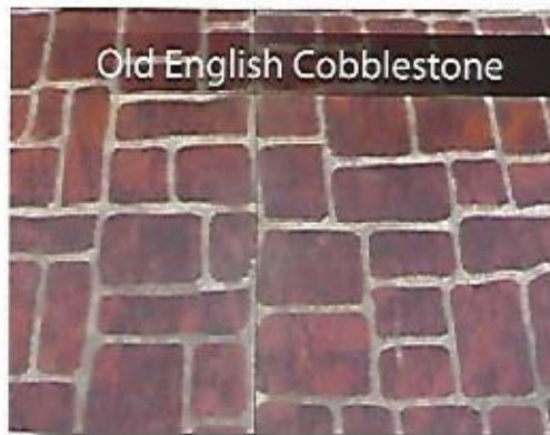
Old English Cobblestone

Color Hardener: El Paso & Terra Cotta Release Color: Liquid Midnight Gray Texture: Old Granite Skin