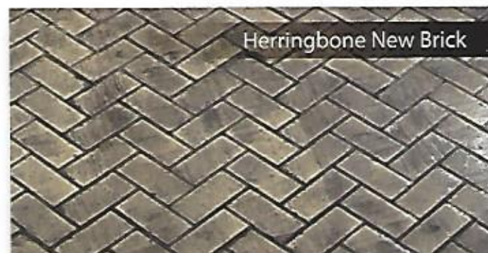
Herringbone New Brick

Color Hardener: Georgia Clay | Release Color: Midnight Gray