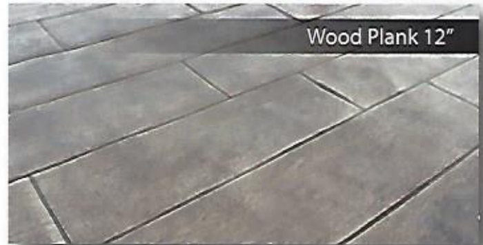
Wood Plank 12"

Color Hardener: Arizona Buff & Splash of Terra Cotta and Saddle Soap | Release Color: Walnut