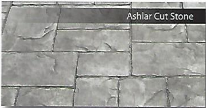
Ashlar Cut Stone

Color Hardener: Pueblo | Release Color: Midnight Gray