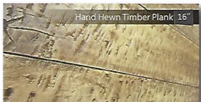
Hand Hewn Timber Plank 16"

Color Hardener: El Paso | Release Color: Mocha