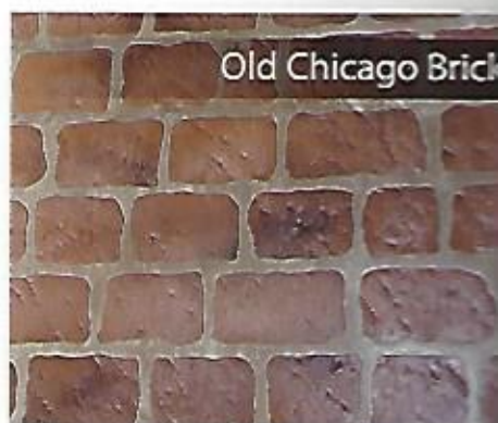
Old Chicago Brick

Color Hardener: Terra Cotta Release Color: Liquid Soft Gray Texture: Stone Roller