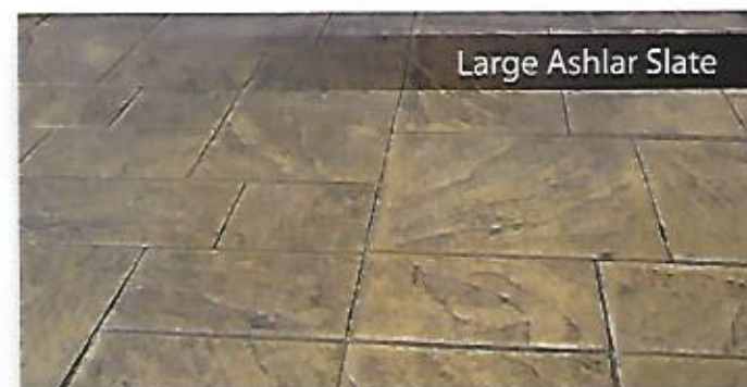
Large Ashlar Slate

Color Hardener: Terra Cotta | Release Color: Midnight Gray