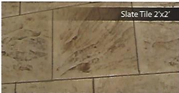
Slate Tile 2'x2'

Color Hardener: Terra Cotta | Release Color: Walnut