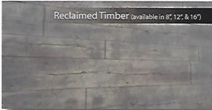
Reclaimed Timber (available in 8", 12", & 16")

Color Hardener: Arizona Buff & Splash of Terra Cotta and Saddle Soap | Release Color: Walnut