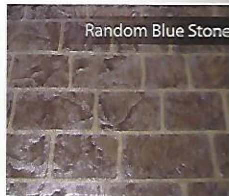
Random Blue Stone

Color Hardener: Tile Red Release Color: Liquid Midnight Gray Texture: Slate Roller