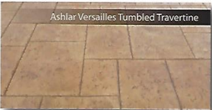
Ashlar Versailles Tumbled Travertine

Color Hardener: Navajo | Release Color: Rock Gray