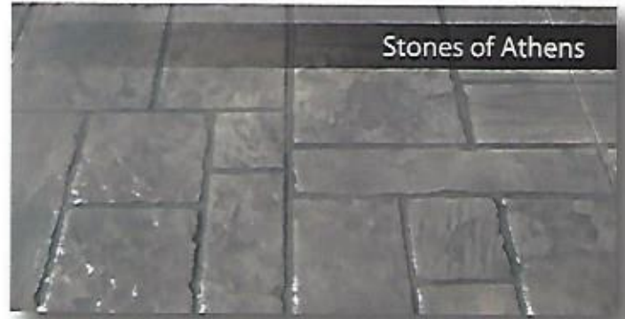
Stones of Athens

Color Hardener: El Paso | Release Color: Walnut